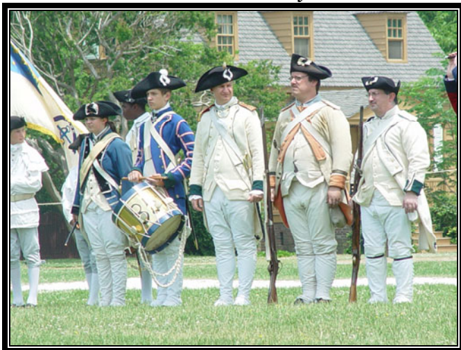
May 2004 - Drummers Call