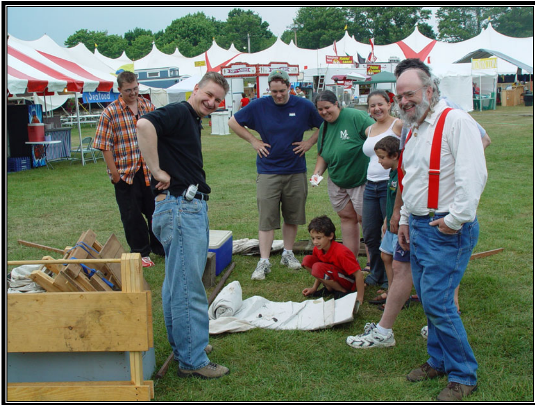
The regiment inspects new recruits... mice! June 2004 – La Kermesse

85ème Régiment de Saintonge Post Office Box 854 Sudbury, MA 01776