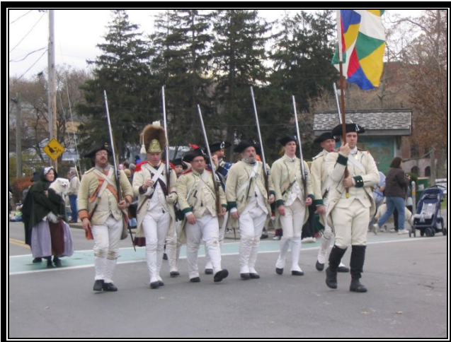
November 2004- Plymouth, Massachusetts