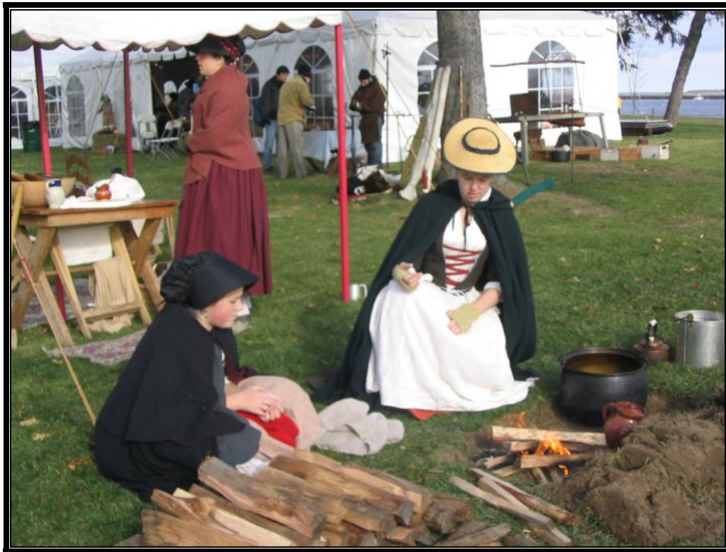
Keeping the food & fire hot to help take the chill out of the day! November 2004 – Plymouth, Massachusetts

85ème Régiment de Saintonge Post Office Box 854 Sudbury, MA 01776