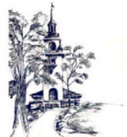
Evacuation Monument at Dorchester Heights

"nation's oldest neighborhood civic organization"