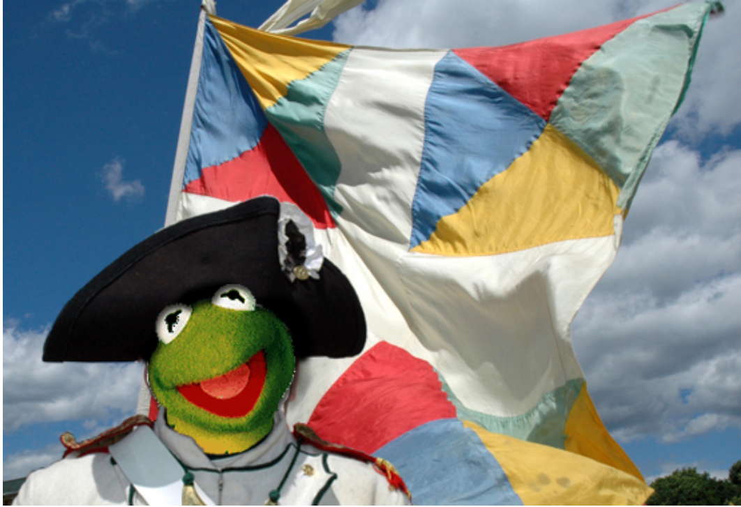
Capitaine Kermit la grenouille

85ème Régiment de Saintonge Post Office Box 854 Sudbury, MA 01776