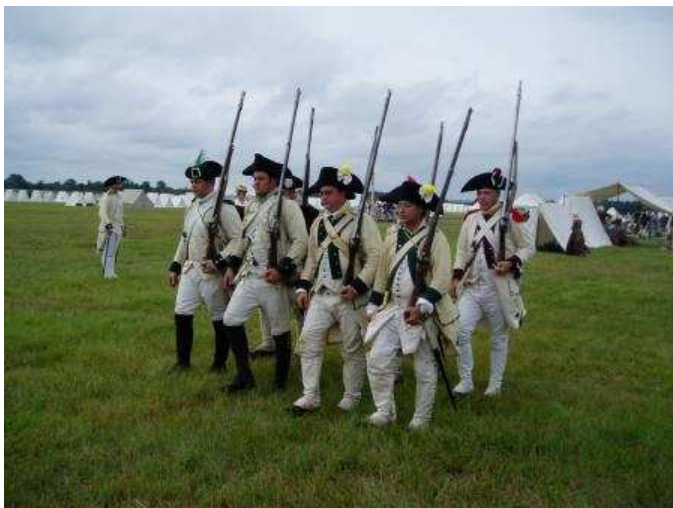
The combined forces of the Saintonge, Foix and Gâtinais on the march at the Siege of Savannah 2004.