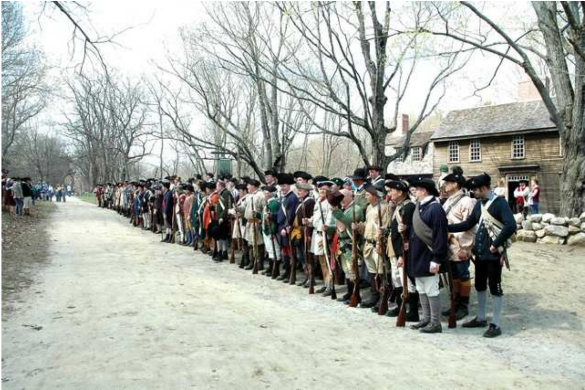
Battle Road April 15, 2006

85ème Régiment de Saintonge Post Office Box 854 Sudbury, MA 01776