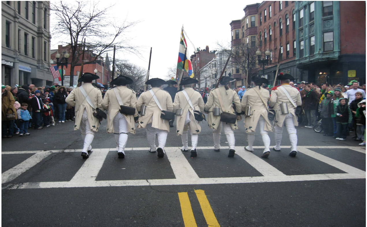
Evacuation Day Parade March 16 th 2008 – Boston MA

85ème Régiment de Saintonge Post Office Box 854 Sudbury, MA 01776