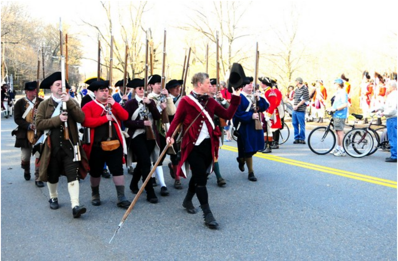
Battle Road March, April 19, 2008

85ème Régiment de Saintonge Post Office Box 854 Sudbury, MA 01776