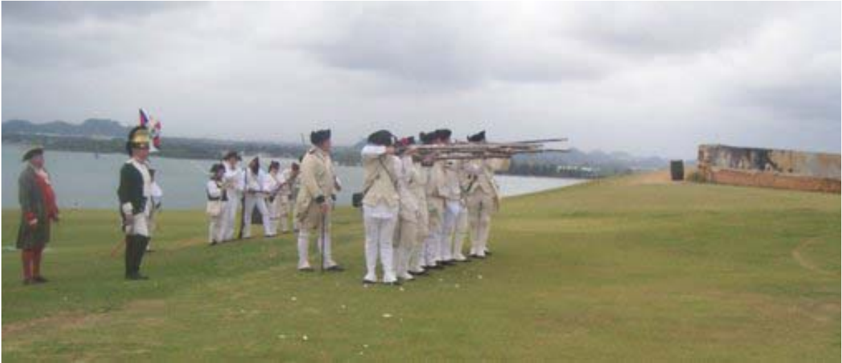
Siege of San Juan El Castillo San Felipe del Morro, San Juan

85ème Régiment de Saintonge Post Office Box 854 Sudbury, MA 01776