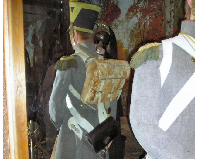
Hair-on-Hide – Both the hair and side panel are missing