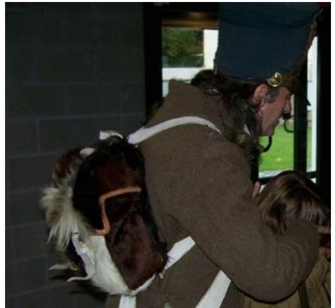
Hair-on-Hide – 1808 Reproduction – pattern correct for our period