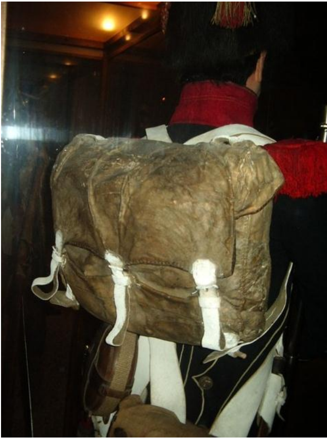
Painted Canvas or "bald" hair on hide – The style pattern is correct for our period

These packs were used through the Napoleonic Wars, despite being the "older" pattern. Enjoy!!!