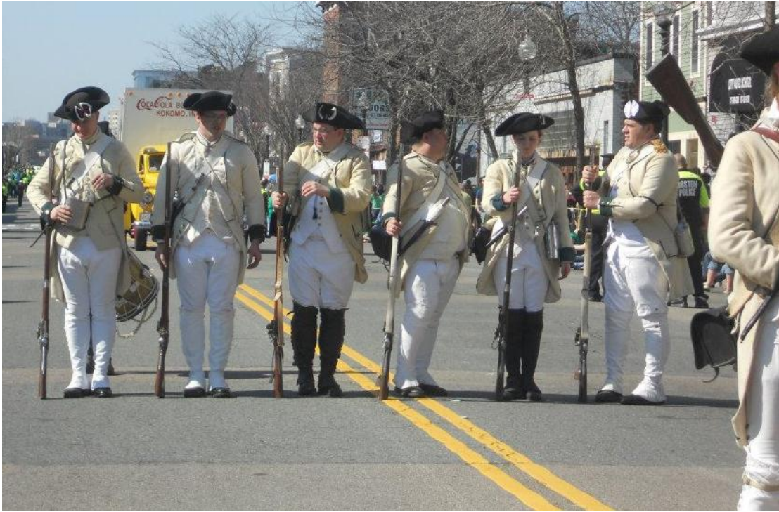
At the start of the parade